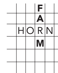
Turn 2: Score 9