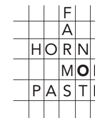
Turn 4: Score 16