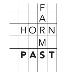
Turn 3: Score 25